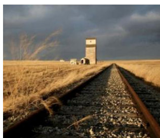
A.L.A. BOOKLIST, VOLUMES 1-3